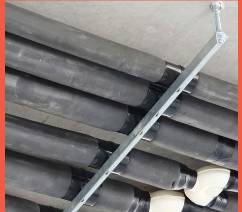
We don't just have the products, our product specialists combine with qualified engineers to create end-to-end solutions together.

Contact our team today to find your custom solution.